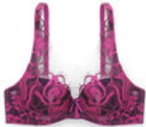
ECB948/81P Balconette Bra

Signature Chasney Beauty Balconette bra with lace straps. Support bra design with sizes up to F cups.