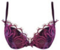
ECB948/31 Push Up Bra

AUSTRALIA : 8-16 / B, C, D, DD, E, F UK : 30-38 / B, C, D, DD, E, F US : 30-38 / B,C,D,DD,DDD,G, H EUROPE : 65-85 / B-H FRANCE : 80-100 / B-H