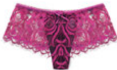
ECB948/14 French Knickers

AUSTRALIA : 8-16 UK : XS-XL US : XS-XL (4-8) EUROPE : XS-XL (36-44) FRANCE : XS-XL (38-46)