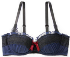
ECB3081/11P Balconette Bra

Modified from the signature Balconette bra, the half cup padded bra is designed with pleated mesh and stretchable narrow Leavers lace. Apex made with laces in triangle shape provides extra lift up.